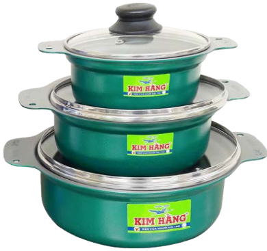
Trung Sa Pot