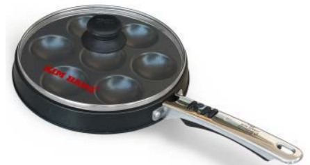
Mini Savory Pancake Mold Pan