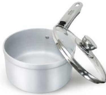
Dough Mixing Pot