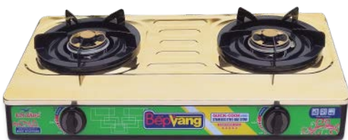
Quick-Cook Gas Stove