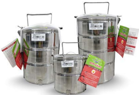
Stainless Steels Mess Kit