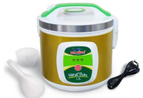
Nang Thom Rice Cooker