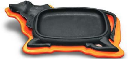
ADC Beefsteak Pan