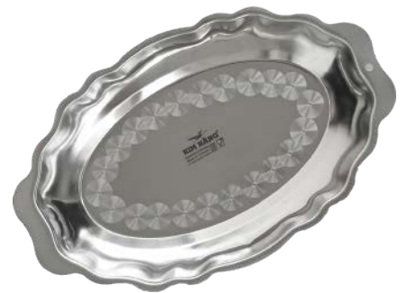
Patterned Steaming Plate