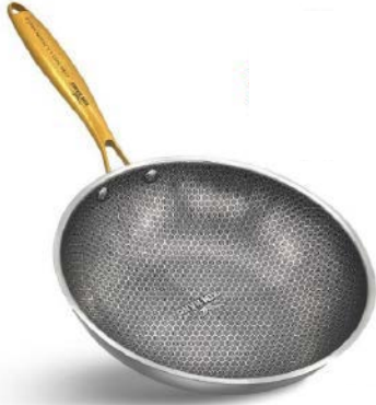
KH Longlife Pan