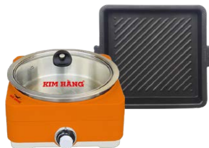
Electric Hotpot & Grill Plate