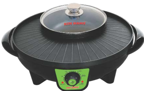
Electric Hotpot and Grill Pan