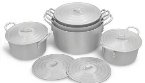
Special Aluminum Pot