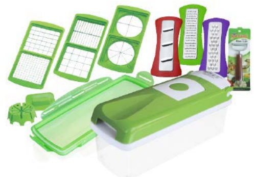
Vegetable and Fruit Peeler