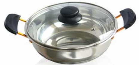
Stainless Steels Hotpot