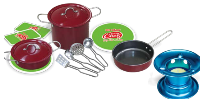
Children's Cooking Playset